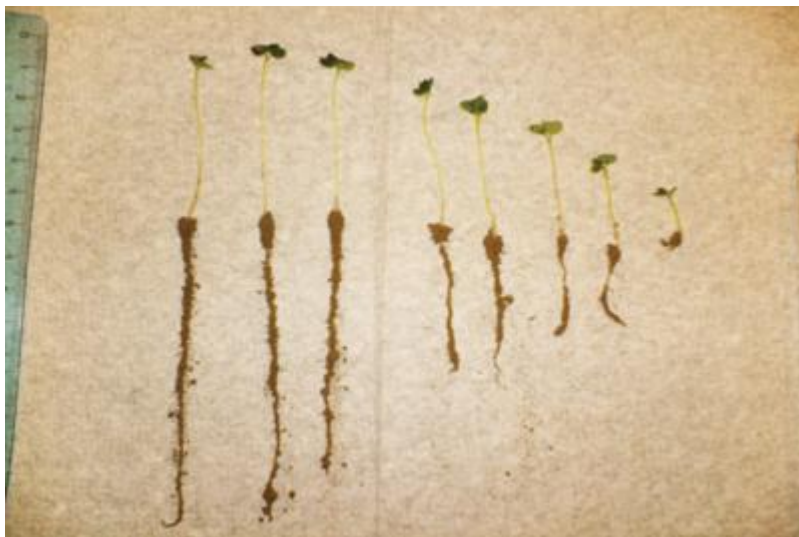
Group 2 carryover can inhibit root and shoot growth.

A new diagnostic tool can help with rotational decisions.