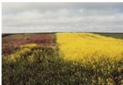
Eroded knolls often have greater phytotoxicity and persistence of residues.

Schoenau explains that the phytotoxicity of a soil residual herbicide refers to the toxic effect that the residue has on plant growth. Phytotoxicity is dependent on the amount of herbicide that sorbs to the soil particles and the rate at which it can desorb back into the soil water.