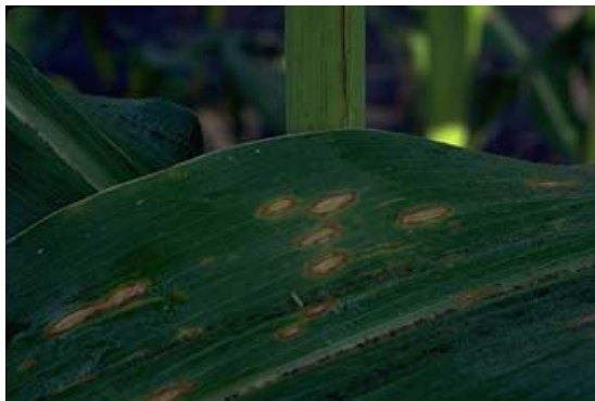
Figure 22. Southern corn leaf blight.

Yellow leaf blight, caused by the fungus Phyllosticta maydis , is more common in the northern United States but can be found in Missouri. Lesions are small (up to 0.5 inch in length), rectangular to oval in shape, and range from yellow to tan or cream-colored. Lesions may be surrounded by a light yellow border. Lesions can coalesce, killing larger areas of leaf tissue. The pathogen