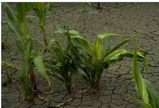
Figure 27. Crazy top of young corn.

The disease causes a deformation of plant tissues, including excessive tillering and rolling or twisting of leaves (Figure 27). On severely infected plants, leaves may be narrow and straplike. There may be a proliferation of the tassel until it resembles a mass of leafy structures (Figure 28). Plants may produce numerous ear shoots. Infected plants are frequently stunted.