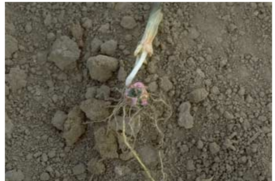
Figure 3. Penicillium mold growth evident on seed.

Most of the seed rots and seedling blights on corn are more severe in wet soils, in low-lying areas in a field and in soils that have been compacted or remain wet for an extended period of time. Low soil temperatures (below 50–55 degrees F) favor seed