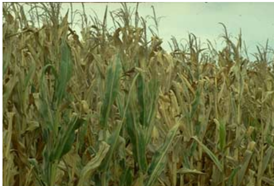
Figure 20. Susceptible hybrid showing severe leaf blighting from northern corn leaf blight.

Hybrids with polygenic (partial) resistance or with monogenic resistance to northern corn leaf blight are available. Polygenic resistance confers resistance to all races of Exserohilum turcicum but the resistance is not absolute for any of these