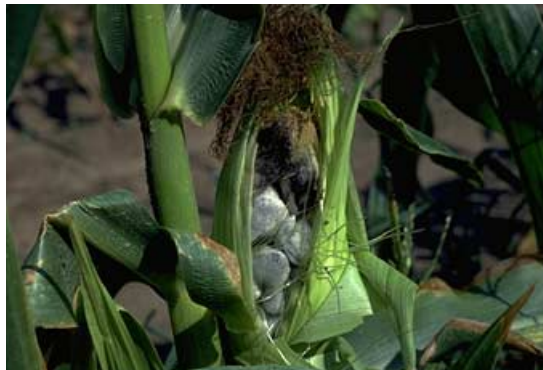
Figure 32. Common smut gall on ear.

Common smut caused by the fungus Ustilago maydis results in the formation of galls on the aboveground portions of the corn plant (Figure 32). Galls tend to be most common on ears and tassels but may also occur on the leaves or stalks, especially near the base of the plant. Initially the galls are firm and silver to grayish white in color throughout. As the galls age, the center of the gall turns into a mass of powdery, black spores, while the outer covering of the gall remains silver to grayish white. The galls usually break open to reveal the masses of powdery, black spores. Galls on leaves tend to remain small, becoming hard and dry (Figure 33).