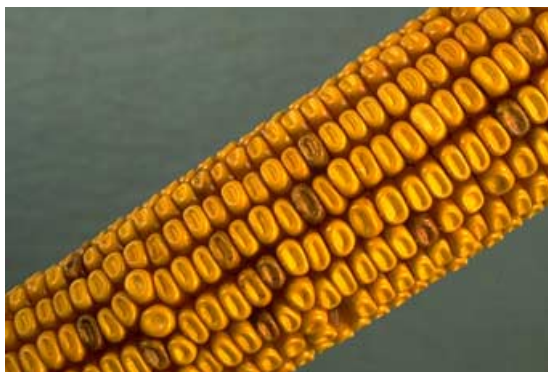
Figure 46. Fusarium kernel rot.

Cool, wet weather immediately after silking favors the development of Gibberella ear rot.