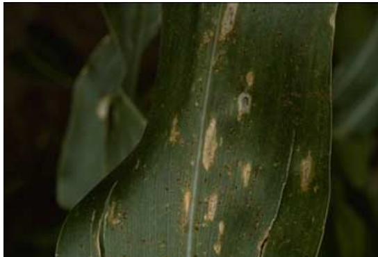
Figure 23. Yellow leaf blight.