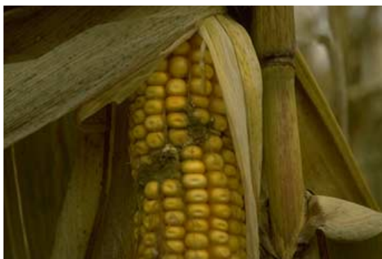
Figure 51. Aspergillus ear rot.

Aspergillus flavus and Aspergillus parasiticus can invade corn in the field, causing an ear and kernel rot. Aspergillus is evident as a greenish yellow to mustard-yellow mold growth on or between kernels, especially adjacent to or in insect-damaged kernels (Figure 51).