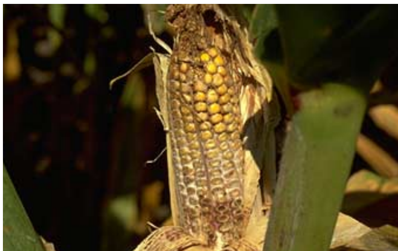
Figure 44. Diplodia ear rot.

Both Diplodia maydis and Diplodia macrospora can cause Diplodia ear rot of corn. The ear leaf and husks on the ear may appear bleached or straw colored (Figure 43). When the husk is peeled back, dense white to grayish white mold growth will be matted between the kernels and between the ear and the husks (Figure 44). Small, black fungal fruiting bodies may be scattered on husks or embedded in cob tissues and kernels (Figure 45). The entire ear may be grayish brown, shrunken, very light-