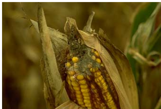
Figure 49. Penicillium ear rot.