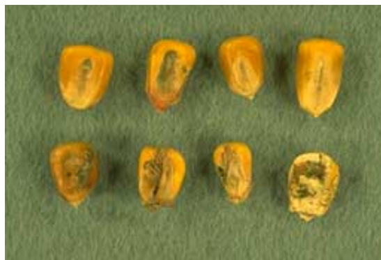
Figure 50. Penicillium blue-eye.