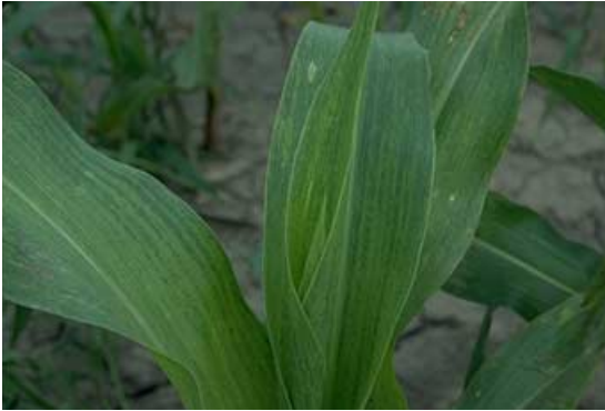
Figure 25. Maize dwarf mosaic.

Occasional shortening of the upper internodes gives a stunted, bushy appearance to the plants. Symptoms may be quite evident but as plants continue to grow and temperatures rise, the mosaic symptoms may fade or disappear and young leaves become more uniformly yellow. Later, plants may have blotches or streaks of red that are generally seen after periods of cool night temperatures (60 degrees F and below). Plants may be slightly stunted, ear size may be reduced or plants may be barren.