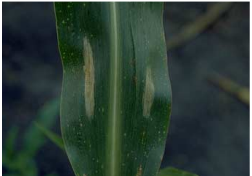
Figure 18. Young northern corn leaf blight lesions.

Northern corn leaf blight lesions are long, elliptical, grayish green lesions ranging from 1.0 to 6.0 inches in length (Figure 18). As the lesions mature they may become more tan in color (Figure 19). During damp or humid weather, dark olive green to black spores may be produced across the