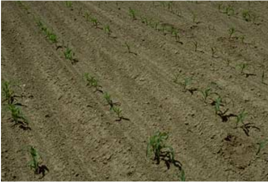
Figure 4. Poor stand due to seedling blight.