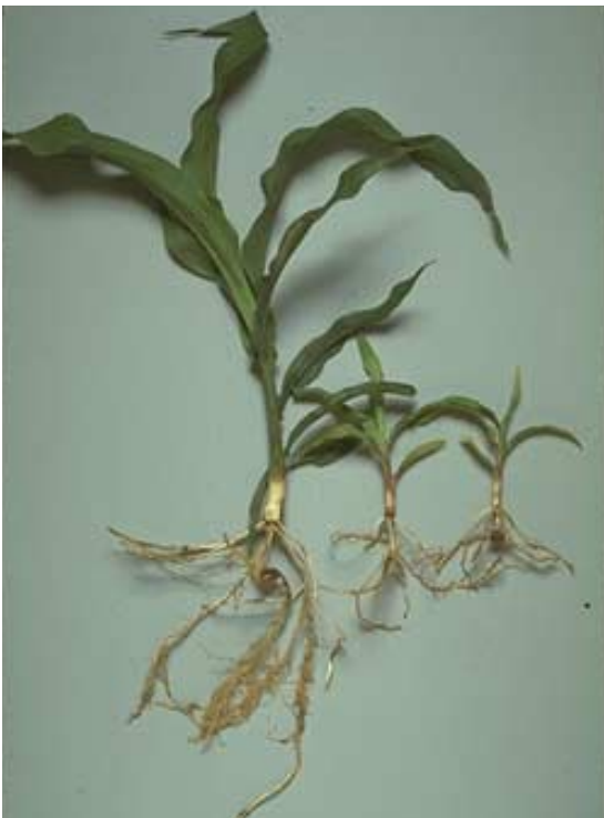
Figure 35. Difference in plant size and root mass between a healthy plant and plants affected by corn nematodes.