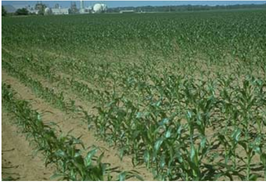
Figure 34. Uneven stand due to corn nematodes.