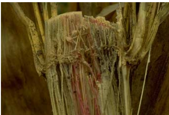
Figure 39. Fusarium stalk rot.

Fusarium moniliforme is commonly found on corn stalks, kernels and other tissues. Actual stalk rot symptoms tend to be prevalent under warm, dry conditions.