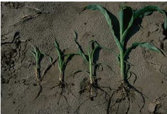
Figure 6. Seedling blight reduces plant height and root mass (three plants on left).

rot and seedling blights. Disease severity is also affected by planting depth, soil type, seed quality, mechanical injury to seed, crusting, herbicide injury or other factors which delay germination and emergence of corn. Residues left on the soil surface may influence the incidence and severity of seedling blight through their effect on soil temperature and soil moisture.