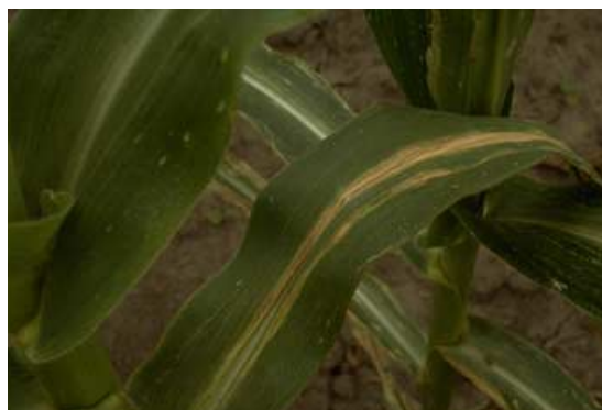
Figure 30. Older lesions of Stewart's bacterial wilt.