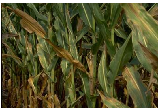
Figure 43. Bleaching of ear leaf and husks from Diplodia ear rot.

green to olive brown mold growth on husks, kernels and cobs of corn plants (Figure 42). Individual kernels may have dark blotches or streaks. The pericarp of the kernel may split to reveal clumps or tufts of dark mold growth. Both fungi are common invaders of dead plant tissues and so may also be found on husks, leaves and stalks as well as on ears and kernels.