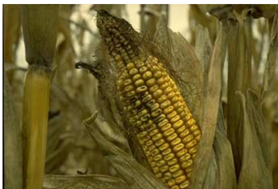
Figure 42. Alternaria and Cladosporium colonizing husks and kernels.