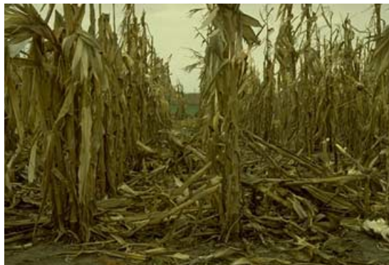
Figure 37. Lodging due to corn stalk rot.

Gibberella stalk rot is caused by the fungus Gibberella zeae , which is the sexual stage of Fusarium graminearum . Leaves on infected plants suddenly turn a dull grayish green while lower internodes soften and turn brown. Stalks often show an internal pink to reddish discoloration of the diseased area and the pith tissues are usually shredded (Figure 38). Small, round, black fruiting bodies of the fungus may develop superficially on the stalks.