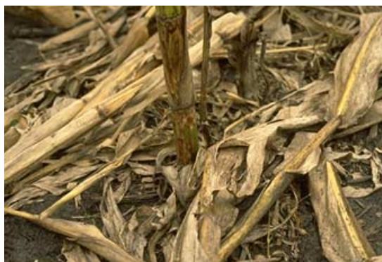
Figure 41. Diplodia stalk rot.

Several weeks after silking, leaves on plants affected with Diplodia stalk rot may wilt, become dry and appear grayish green as though damaged by frost. Plants may die suddenly. Diplodia stalk rot may begin as a brown to tan discoloration of the lower internodes (Figure 41). Stalks become