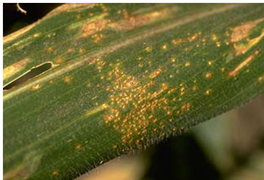
Figure 12. Band of common rust pustules from infection while the leaf was still in the whorl.

Temperatures in the range of 60 to 77 degrees F and high relative humidity favor