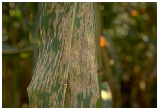
Figure 9. Large areas of leaf tissue killed by gray leaf spot.