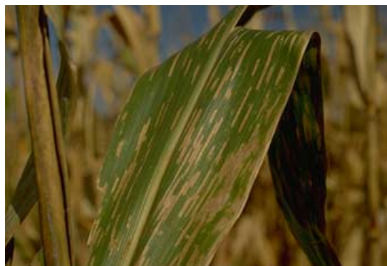
Figure 8. Mature gray leaf spot lesions.