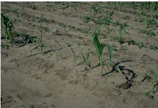
Figure 5. Uneven stand due to seedling blight.