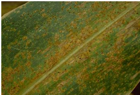
Figure 11. Common rust.

of infection that occurred while the leaf was still in the whorl (Figure 12). The pustules quickly rupture to reveal masses of rusty brown spores. As plants mature, the pustules become brownish black in color. Common rust pustules may develop on both upper and lower leaf surfaces as well as on leaf sheaths, husks and stalks (Figure 13). When rust is severe, leaves and leaf sheaths may yellow and die prematurely.