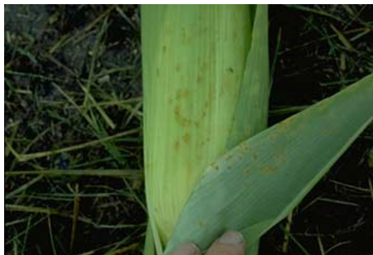
Figure 13. Common rust on husks.