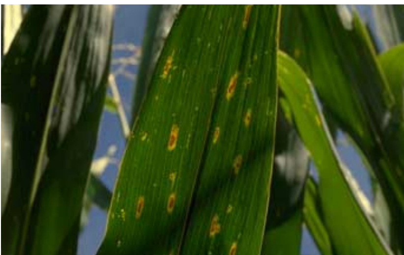
Figure 7. Young gray leaf spot lesions.

The fungus that causes gray leaf spot survives in infested residues left on the soil surface. Gray leaf spot is more severe when corn is planted after corn. Spores produced on infested residues are spread by wind or splashing water to corn plants. Prolonged periods of overcast weather, heavy dews or fog favor the development of gray leaf spot.