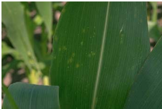
Figure 10. Initial symptoms of common rust.

Common rust is caused by the fungus Puccinia sorghi . Rust pustules begin as small, circular, light green to yellow spots in the leaf tissue (Figure 10). These lesions develop into circular to elongate, golden-brown to reddish brown, raised pustules (Figure 11). The rust pustules may be in bands or concentrated patches on the leaf as a result