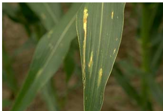
Figure 29. Early symptoms of Stewart's bacterial wilt.

Stewart's bacterial wilt of corn is caused by the bacterium Erwinia stewartii and is spread by flea beetles. Foliage symptoms include linear, pale green to yellow streaks that tend to follow the veins of leaves and originate from feeding marks of the flea beetle (Figure 29). These streaks soon become dry and brown (Figure 30). They