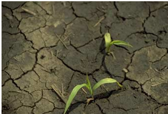
Figure 2. Postemergence seedling blight.

The Pythium species that cause seedling blight are soil inhabitants and survive as saprophytes colonizing crop residues. They also survive in soil or in residues as microscopic, round survival structures called