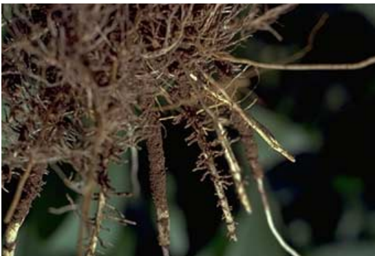
Figure 36. Root pruning caused by corn nematodes.

nematode injury are easily confused with other types of corn production problems, nematode problems should be diagnosed by submitting soil and root samples to a laboratory qualified to run a nematode analysis on the samples. For most of the corn nematodes, samples should be taken in midseason. Samples for needle nematode should be taken early in the season before corn reaches the eight-leaf stage.