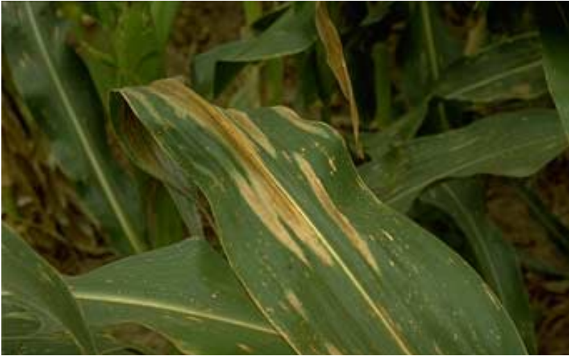
Figure 19. Northern corn leaf blight.

surface of the lesions. Northern corn leaf blight usually begins on the lower leaves of the plants. As the season progresses, nearly all leaves of a susceptible plant may be covered with lesions, giving the plant the appearance of having been injured by frost (Figure 20). Northern corn leaf blight is most severe when temperatures are in the range of 64 to 80 degrees F and when prolonged periods of dew or wet, overcast weather keep the foliage wet for extended periods of time.