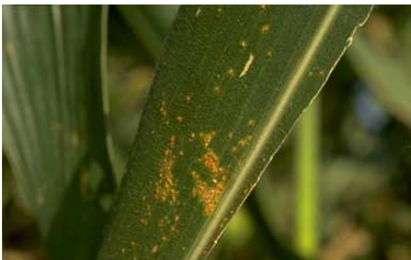
Figure 14. Southern rust.

Colletotrichum graminicola is the fungus that causes anthracnose leaf blight as well as anthracnose stalk rot. Anthracnose leaf blight is most common on lower leaves of