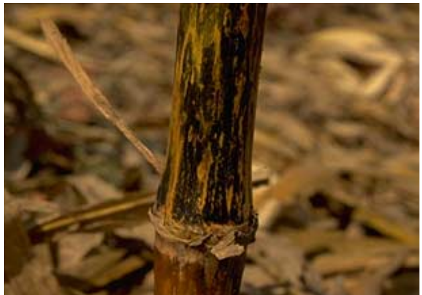
Figure 40. Anthracnose stalk rot.

Anthracnose stalk rot, caused by the fungus Colletotrichum graminicola , may be most evident at the nodes. Stalk symptoms generally appear after tasseling as narrow, vertical to oval, water-soaked lesions on the stalk near the nodes. These lesions turn tan to reddish brown then become shiny black later in the season (Figure 40). Stalk lesions can coalesce, forming relatively large, dark brown to shiny black, blotchy areas or streaks that may be somewhat sunken. The lesions may merge to discolor much of the