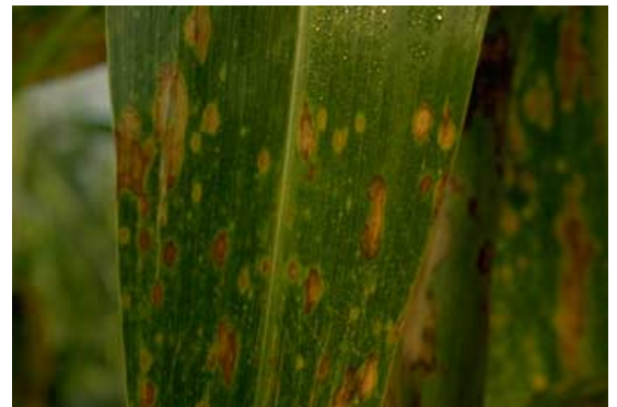
Figure 21. Northern corn leaf spot.

Five races of the northern corn leaf spot pathogen are known to exist. Symptoms do vary depending on the race involved. Race 0 may cause small lesions on young corn, is not usually found on mature plants and is not considered to be an important pathogen. Race 1 tends to occur on only a few corn genotypes. Race 1 lesions are small, oval to circular lesions. Race 1 may also attack ears of susceptible