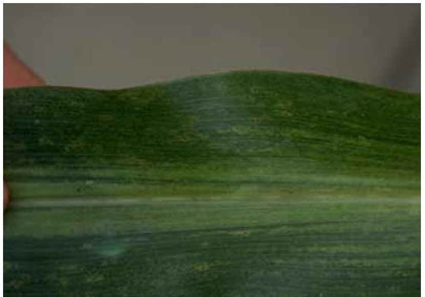
Figure 26. Maize chlorotic dwarf.