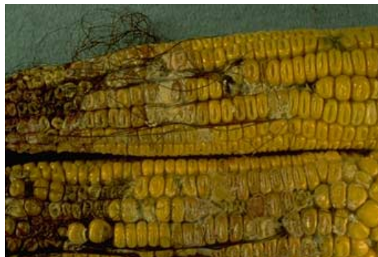
Figure 48. Gibberella ear rot on hail-damaged ears.

Several species of Penicillium can cause ear rot of corn. Blue-green or gray-green tufts or clumps of mold erupt through the pericarp of individual kernels or on broken kernels (Figure 49). Colonies of Penicillium tend to be small, discrete colonies with a dusty or powdery appearance. The fungus may actually invade the kernel giving the embryo a blue discoloration. Blue-eye is