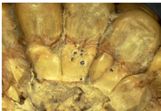
Figure 45. Diplodia fruiting bodies embedded in kernel and cob tissue.