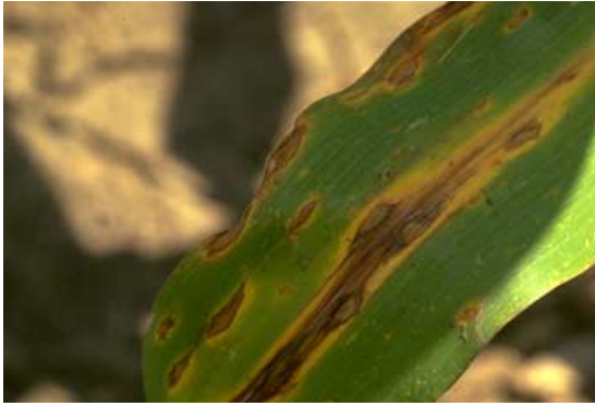
Figure 16. Anthracnose leaf blight on upper leaf.