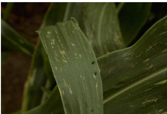
Figure 31. Flea beetles and their feeding damage.

Although the foliage symptoms of Stewart's bacterial wilt are common on field corn in Missouri, the damage is seldom of economic significance. Stewart's bacterial wilt can be very destructive on some sweet corn hybrids and corn inbreds.