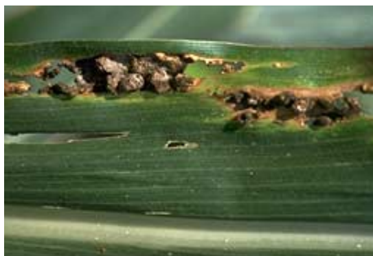
Figure 33. Common smut galls on leaf.