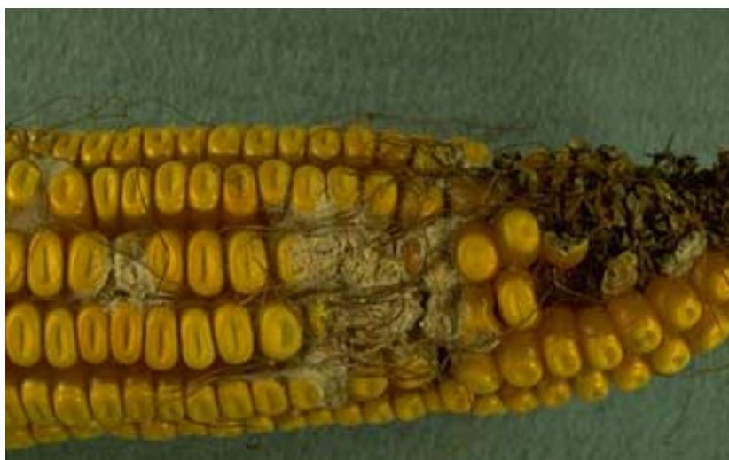
Figure 47. Gibberella ear rot.