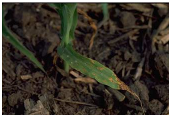
Figure 15. Anthracnose leaf blight on young, lower leaf.