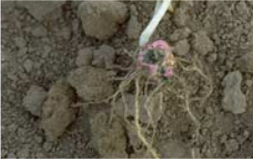
Figure 1. Seed rot and preemergence seedling blight.

preemergence seedling blight, the coleoptile and developing root system tend to turn brown and have a wet, rotted appearance (Figure 1). With postemergence seedling blight, the seedlings tend to yellow, wilt and die (Figure 2). Brown sunken lesions may be evident on the mesocotyl (region between the seed and the permanent or nodal root system). Eventually the mesocotyl becomes soft and water soaked. Mold growth may be evident on decayed seed or plant tissues. The root system is usually poorly developed, and the roots are brown, water soaked and slough off.