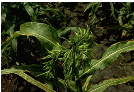
Figure 28. Tassel proliferation due to crazy top.

In seasons with wet springs, young corn plants subjected to saturated soil conditions may show symptoms of crazy top. Occasionally a band of affected plants may encircle a drowned out spot in a field. Some hybrids may be more susceptible to crazy top. This disease is seldom severe enough to cause significant losses.