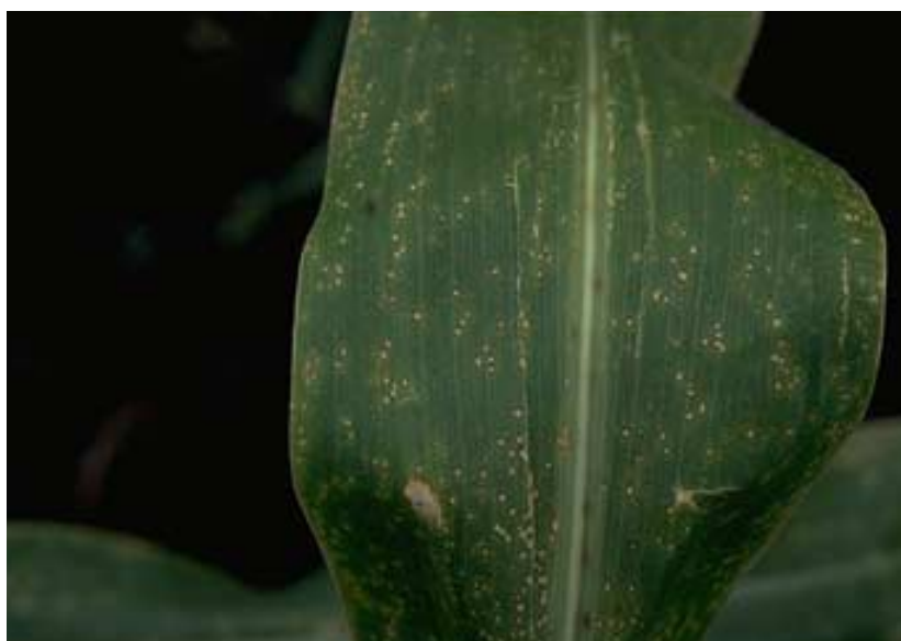
Figure 24. Eyespot.

Eyespot is favored by cool, humid or overcast weather. The disease tends to be more severe when corn follows corn and under reduced or no tillage practices. Resistant hybrids are available in areas where eyespot is a serious problem.